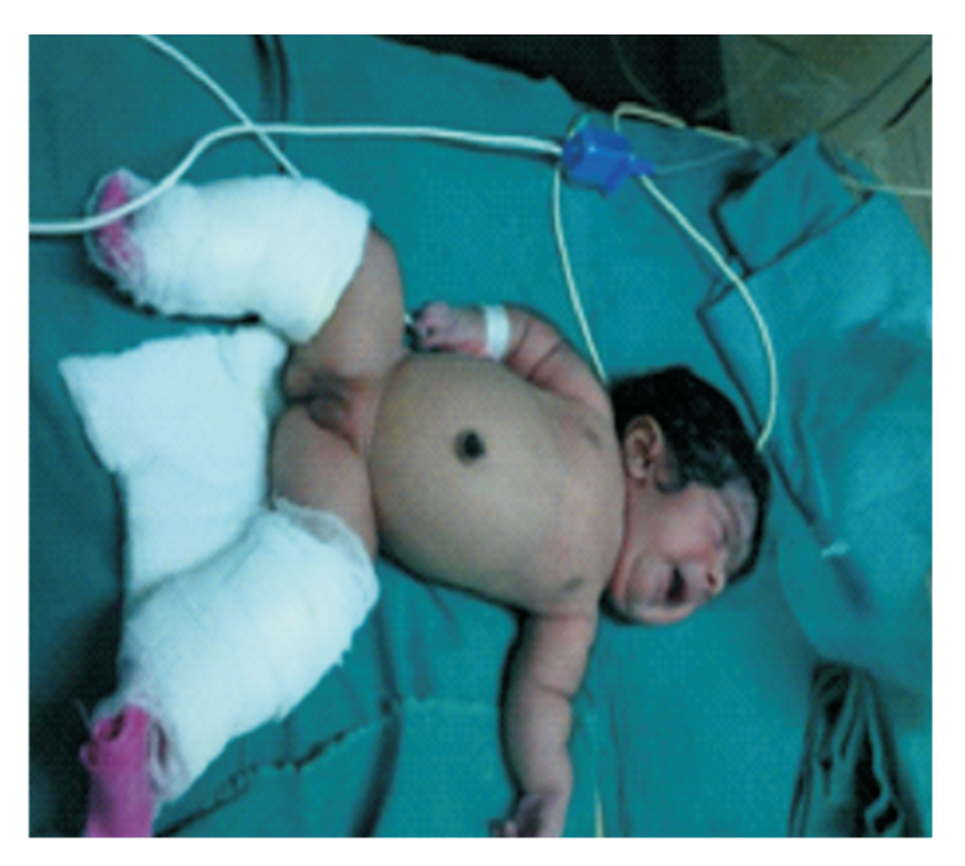
Figure 5. Baby with splinting of limbs

Clinical diagnosis:- Osteogenesis Imperfecta type IIA. orthopaedic opinion was taken and splinting done. Baby shifted to mother's side after a week and discharged at request after 2 weeks. Parents were adviced to bring the baby for review after 2 weeks but lost for follow up.