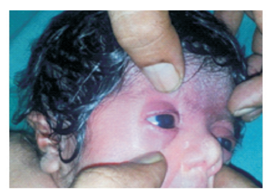
Figure 2. Face of the new born highlighting the blue sclera