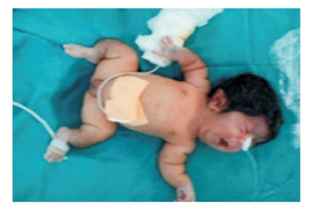
Figure 1. New born baby in frog leg position with nasogastric tube and umbilical vein catheterisation

Hearing – Arousal test was positive. Baby shifted to neonatal intensive case unit (NICU) for warmer care and further management.